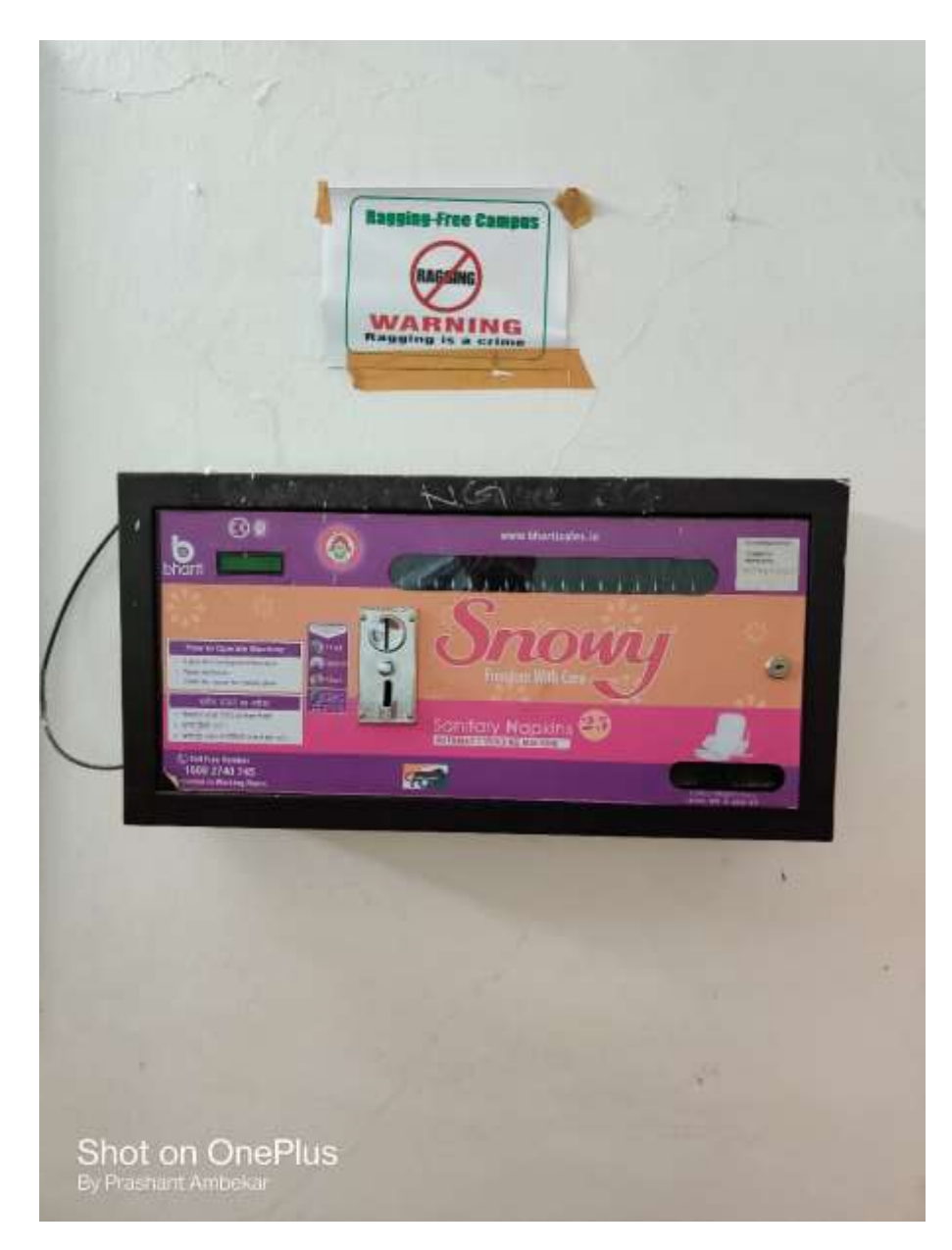
7.1.1. Dispenser Facility in the common room