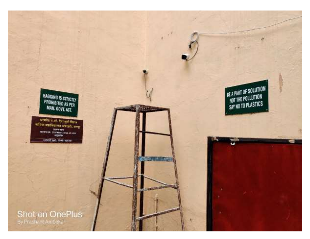
7.1.1 CCTV Cameras Installed