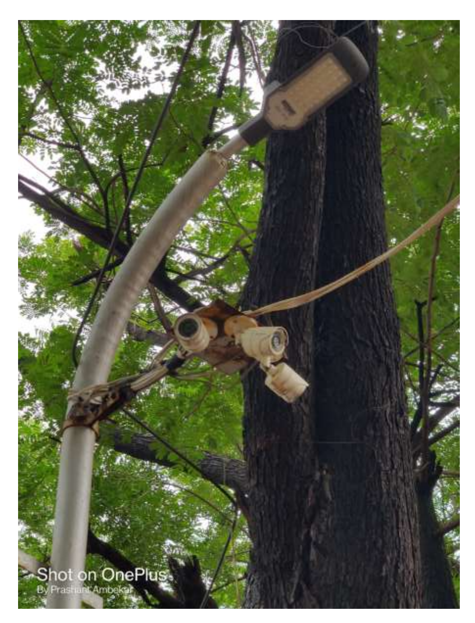
7.1.1. CCTV Cameras Installed