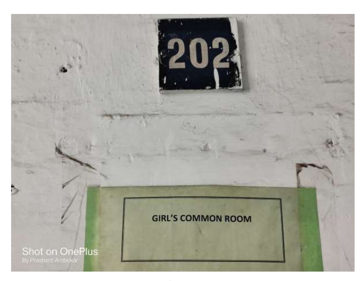
7.1.1. Girl's Common Room